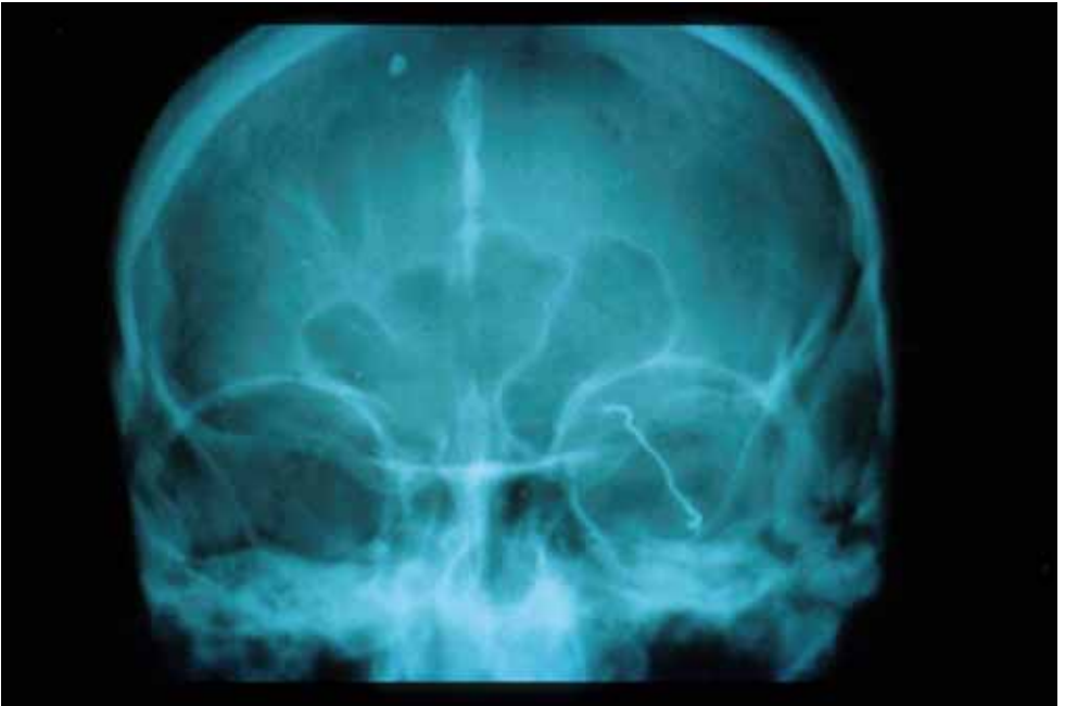
The wire that destroyed my left eye can be seen, as well as shrapnel in the top of the forehead just to my right. (X-rays are reversed; my right side is the left of the photo.)