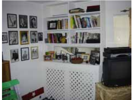
In our spare time: Adventures in Condo Management Can you find the hand in the first picture? (Lower left.) Dead body in kitchen (legs,) “yellow vodka” on couch, living room, spider webs, brownies, living room after repairs, restored bookcase.