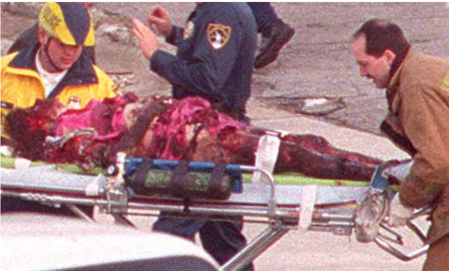
Greatly enlarged section of above photograph. The photo is unclear due to the enlargement, but shows her burns. An EMT said she had never seen anyone survive who looked so bad.