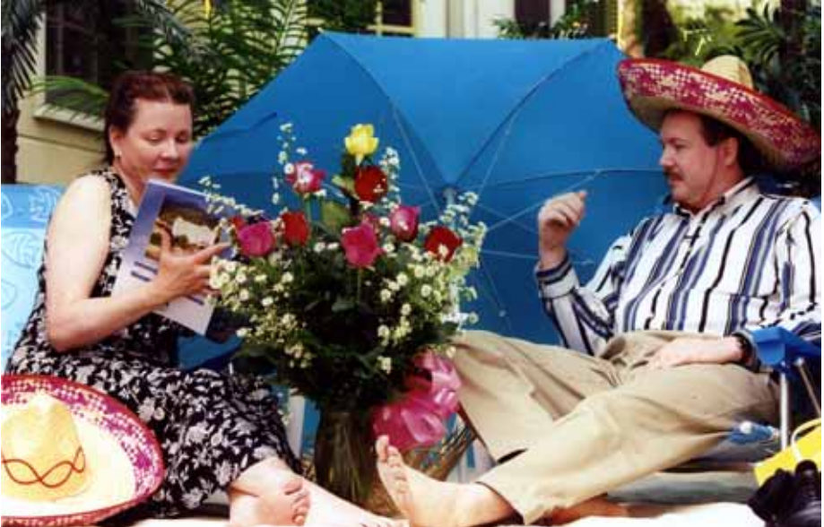
The Things We Do For Love (Lifetime TV) sent us to Cancun, Mexico. This is our idea of fading into the sunset!