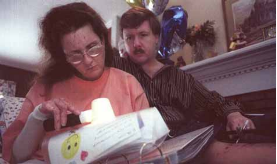
Pulling Iodaform from right leg, eye drops at home, reading mail.