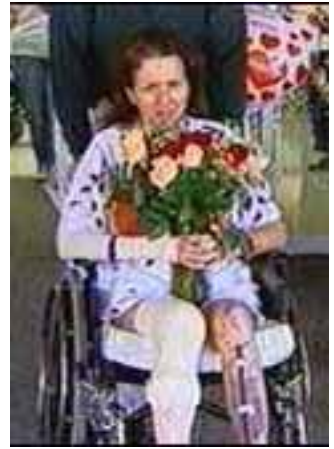
Leaving the hospital.