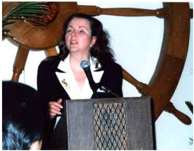
Speaking at NARAL