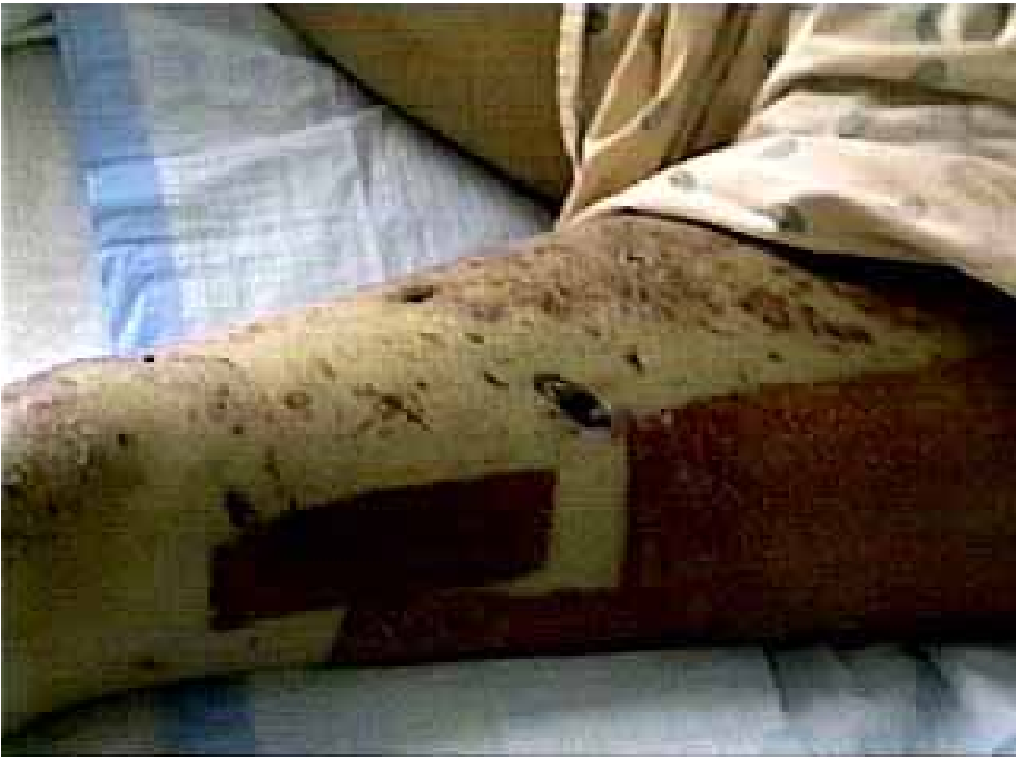
The skin graft donor site took months to heal.