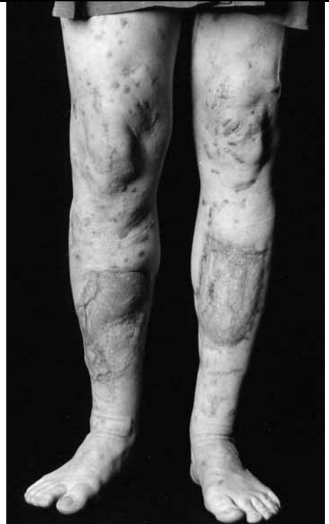
Birmingham is famous for BBQ. My legs were a mess, but I still marched on Washington, D.C. The bottom right photo was taken a year after the attack.