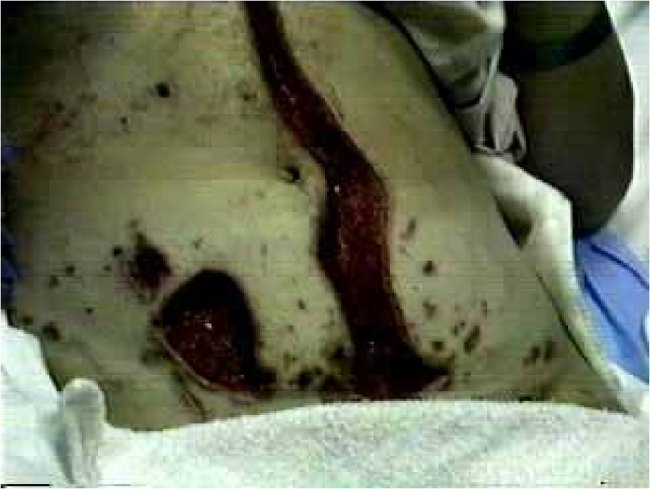
How would this look in a bikini? Taken after six weeks of healing. The hole in my lower right abdomen was about the size of a fist. (My head is off the top of the photo. Belly button in center.)