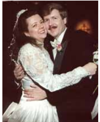
UAB Nurse graduation 1977, together again 1992, wedding 2/14/94.