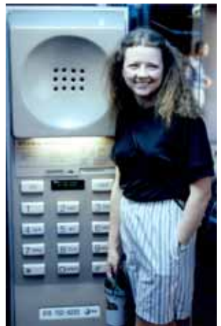
Big phone bill in California. (Universal Studio.)