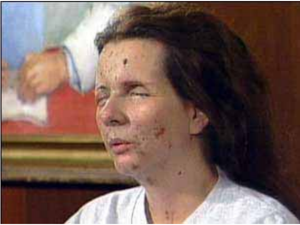
Blind at first press conference.