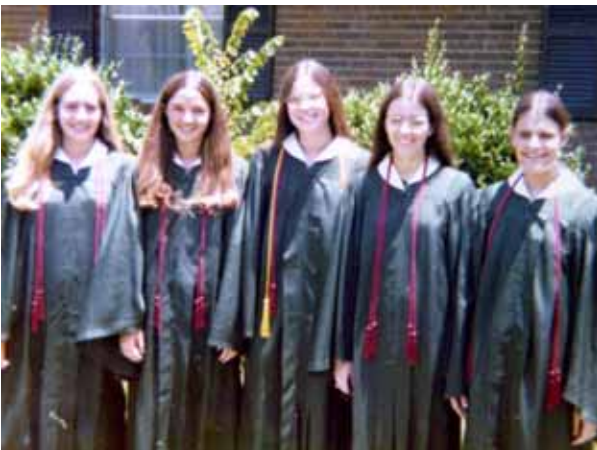
Three of the Fab Five became nurses.