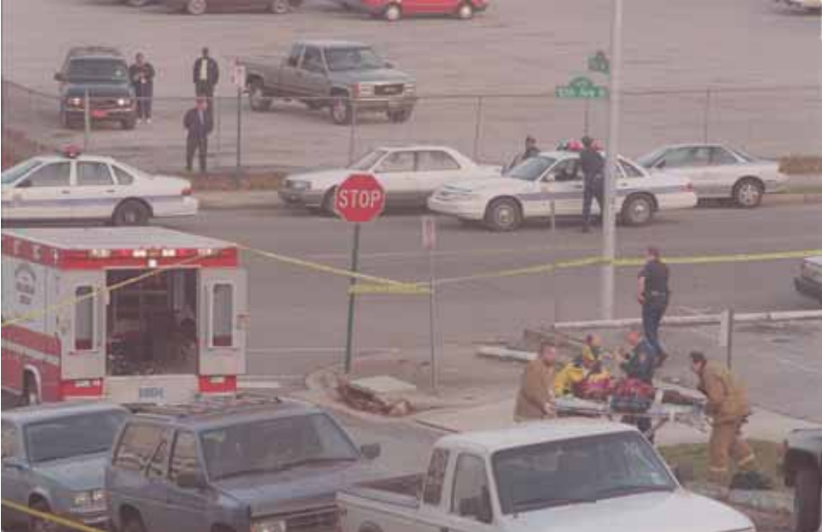
Chaos as Emily is loaded into an ambulance.